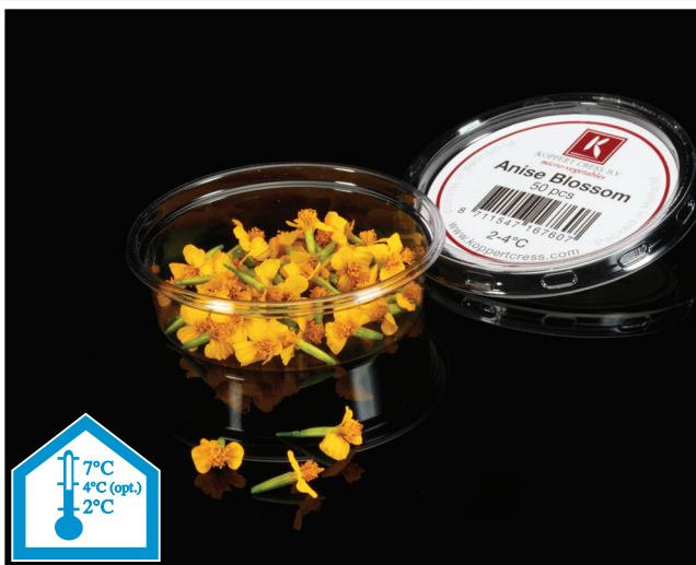
Content: 50 blossoms in a cup, four cups in a Koppert box (20x30 cm)

Produced in a socially responsible culture, Anise Blossom meets the hygienic kitchen standards. The product is ready to use, since it is grown clean and hygienically.