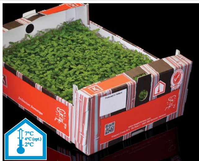
Content: 16 cups in a solitary box (30x40 cm)